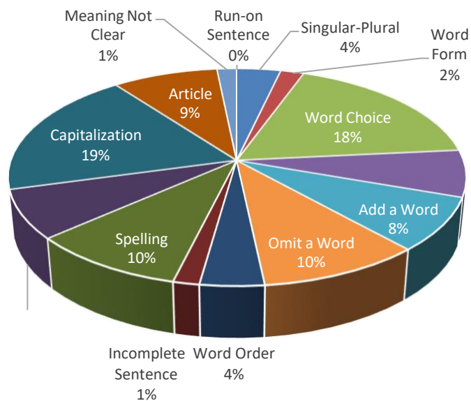
The Percentages Chart of Errors

Based on the calculation above, it can be explained that the total errors of capitalization were 57 errors under the percentage 19%, word choice were 54 errors under the percentage 18%, omit a word were 30 errors under the percentage 10%, spelling were 29 errors under the percentage 10%, article were 26 errors under the percentage 9%, add a word were 24 errors under the percentage 8%, punctuation were 22 errors under percentage 7%, verb tense were 21 errors under the percentage 7%, word order were 12 errors under the percentage 4%, singular-plural were 11 errors under the percentage 4%, word form were 6 errors under the percentage 2%, incomplete sentence were 5 errors under the percentage 1%, meaning not clear were 5 errors under the percentage 1%, and run-on sentence with no error found.